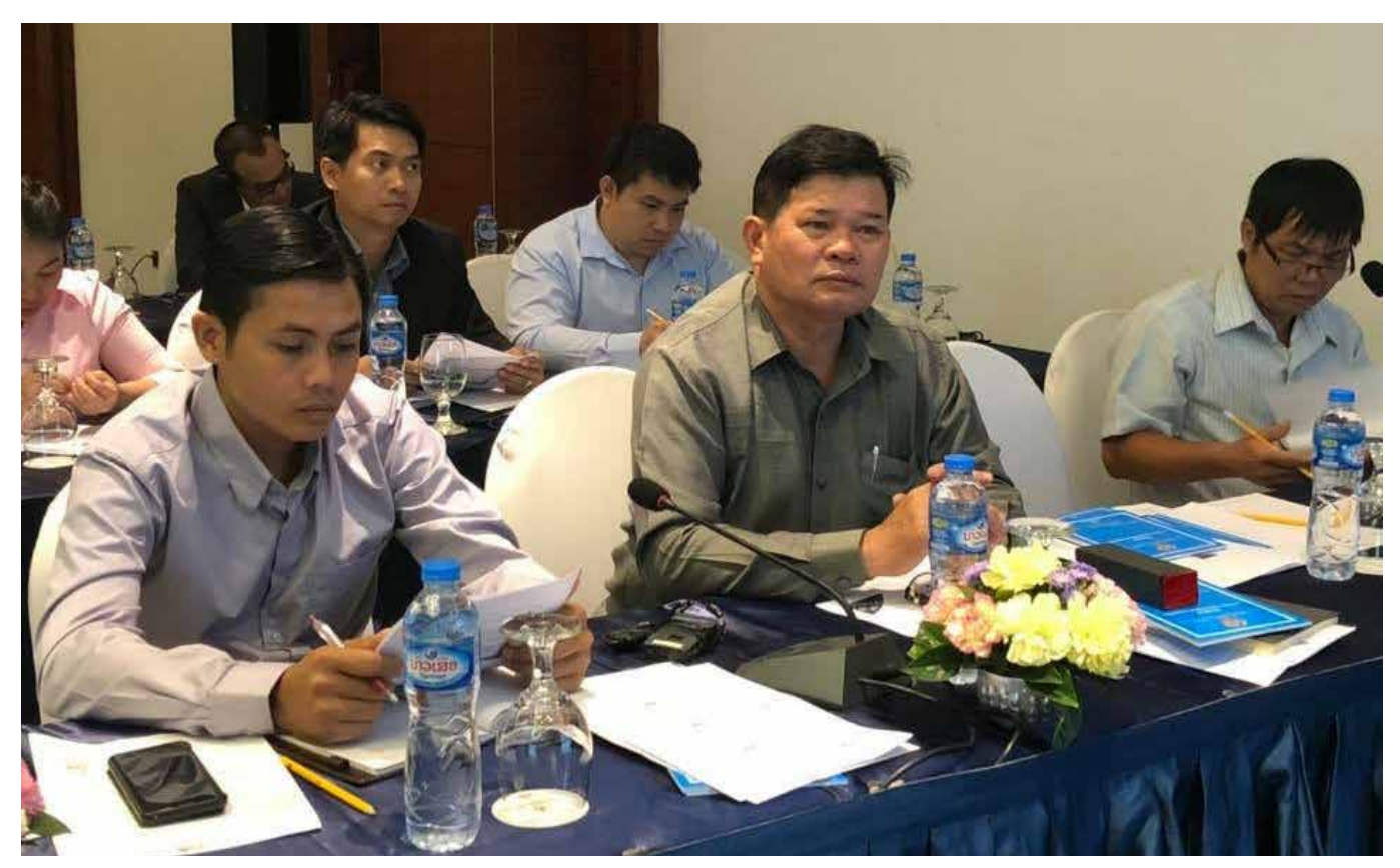
Above: Workshop on Competition Policy in Lao PDR, December 2018

It was also great to talk about the ACCC's experiences with cartel investigations, which in the absence of a local and concrete code of conduct was beneficial for the VCCA.