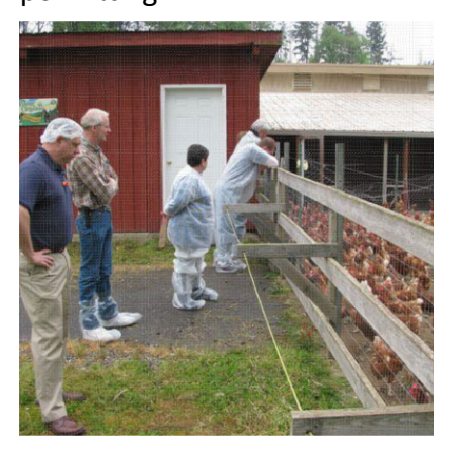
Cage free/barn raised 1.5 sq. ft./bird