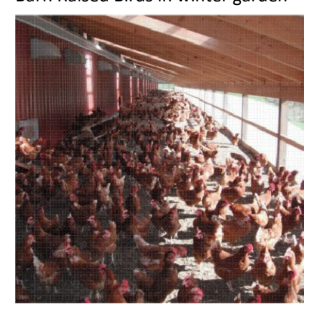
Barn Raised Birds in winter garden