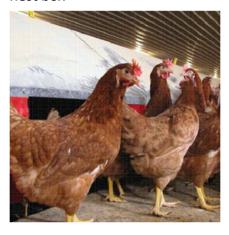
Barn raised birds in front of nest box