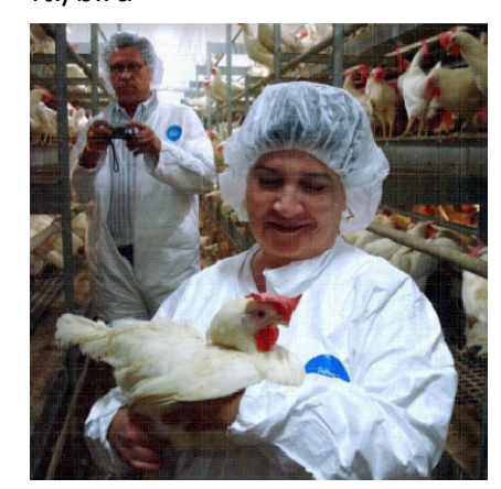
Barn Raised - aviary system/multi-tier 1.0 sq. ft./bird