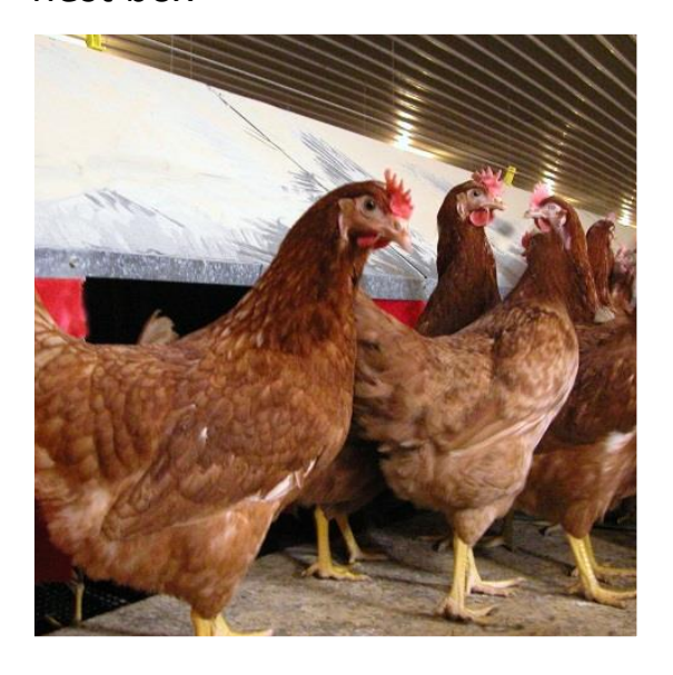
Barn raised birds in front of nest box