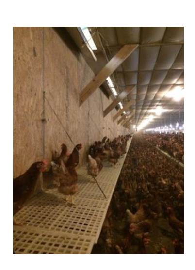
HFAC Laying Hen Standards January 5, 2018