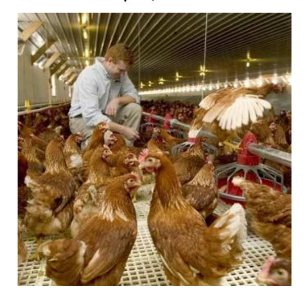
Cage-free system on raised slats – 1.2 sq ft./bird