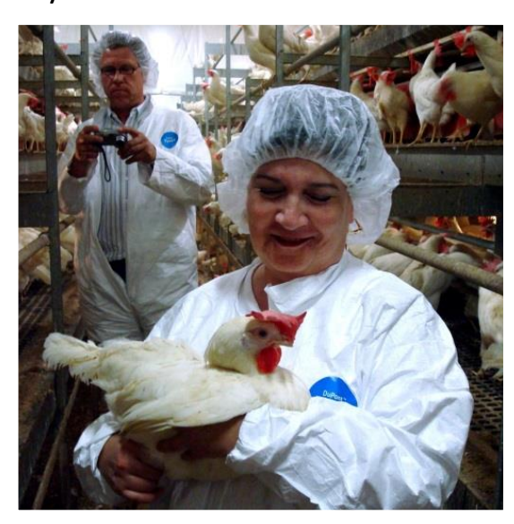
Barn Raised - aviary system/multi-tier 1.0 sq. ft./bird