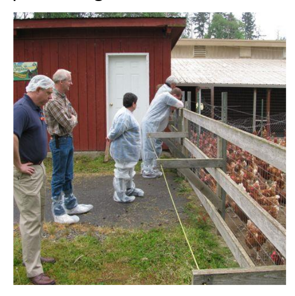
Cage free/barn raised 1.5 sq. ft./bird