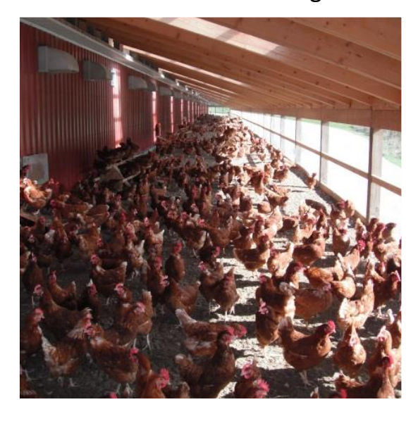
Barn Raised Birds in winter garden