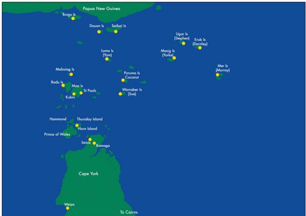
Map 1 – FNQ Communities