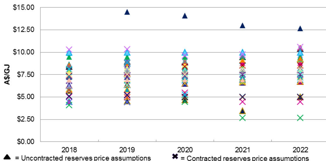
Chart 3.1: Gas price assumptions underpinning producers' reserve estimates