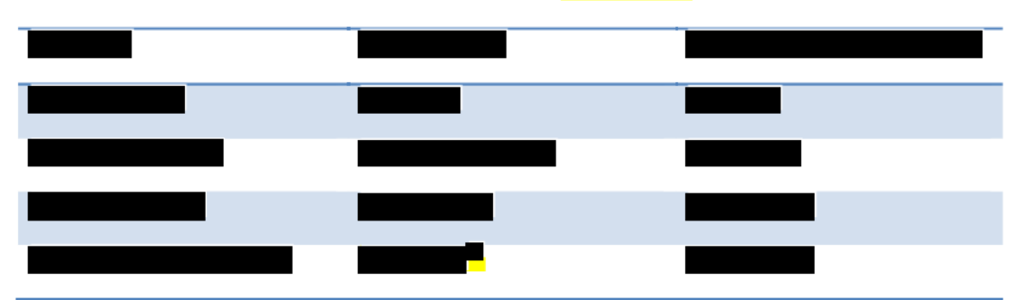
Table 3.2 - Estimated costs of compliance (c-i-c starts)

[c-i-c ends] Clublinks also noted that if regulation forced them out of business, their 1600 customers would be left without the service Clublinks currently provides and would have to resort to Mobile 4G services.<sup>48</sup>